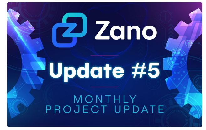
Zano Monthly Project Update #5 - February 2025