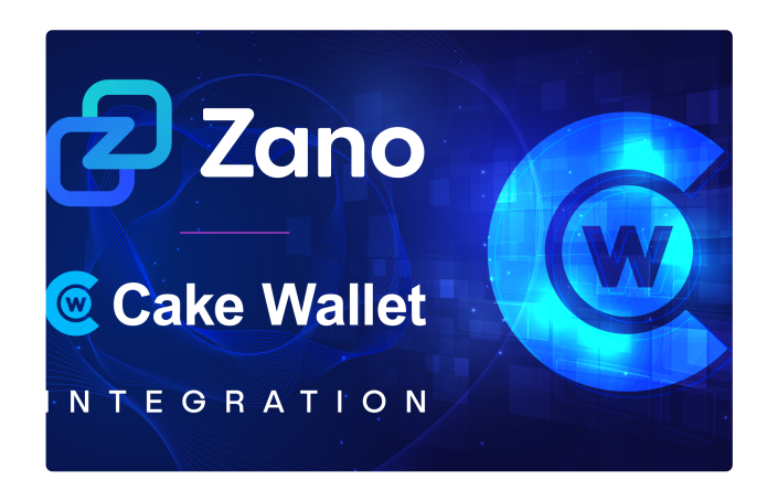
Cake Wallet has integrated the Zano ecosystem