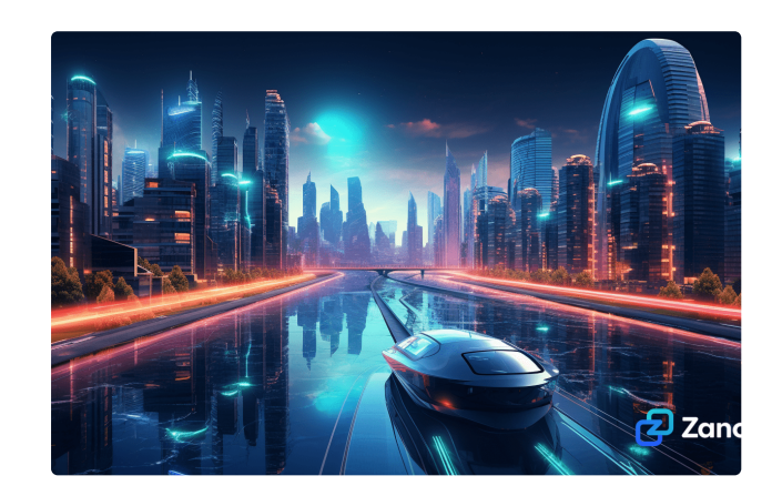
Building the Future: What's Next for Zano?